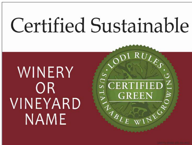
24" x 32" sign templates

Two sign options are available: a horizontal orientation (24" x 32") and a vertical orientation (32" x 24"). The horizontal option is designed to be read from a passing car, so it is well-suited for road-side vineyards. Signs are customizable with your vineyard, winery, ranch, and/or vineyard management name, and are available with our LODI RULES, CALIFORNIA RULES , or CERTIFIED GREEN seal.