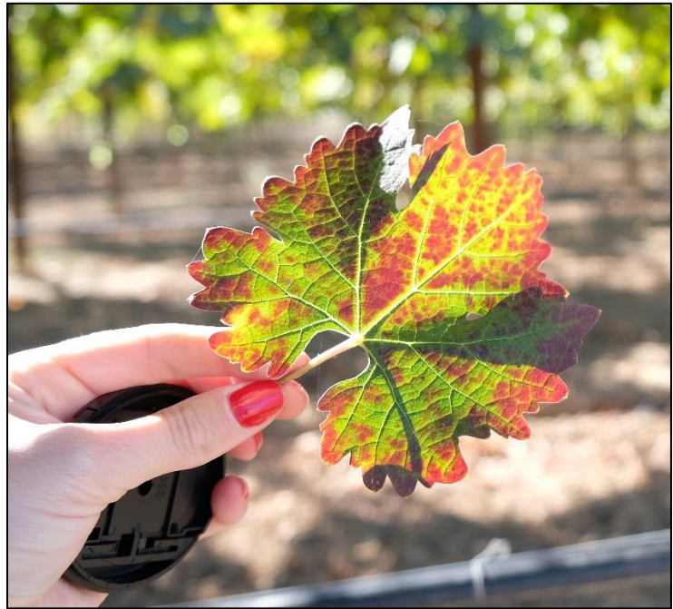
This leaf is from a Cabernet Sauvignon vine which was marked for roguing due to virus just weeks prior to harvest. The best time to scout for red leaf virus symptoms is around harvest.