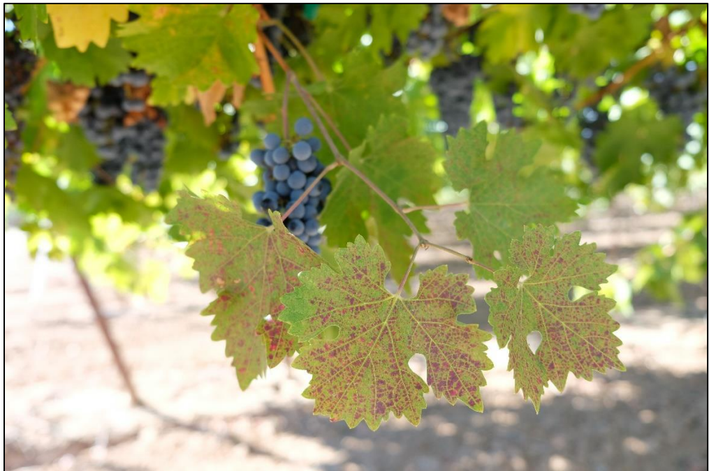
The spotty red color in these Cabernet leaves is likely due to mites, not a virus.