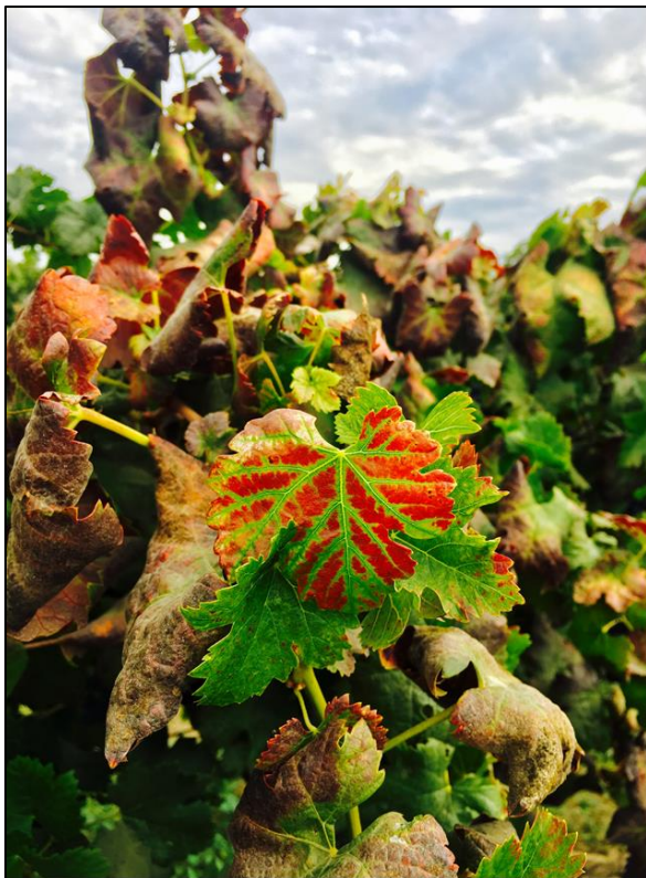
The red colors in the leaves in this Merlot vineyard only showed up after the mites were controlled.