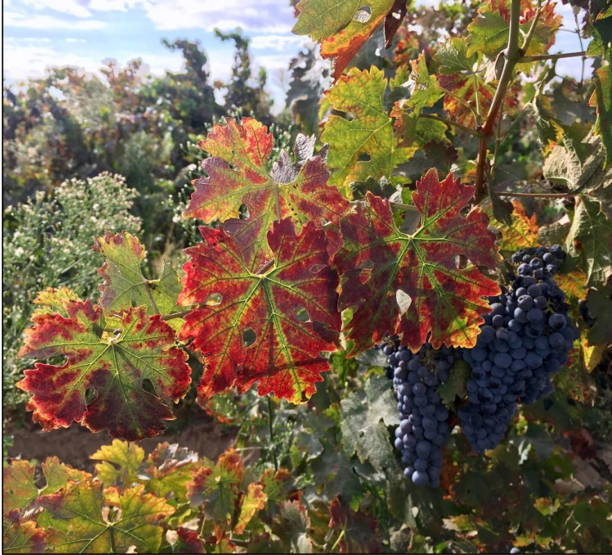
This Cabernet Sauvignon vineyard has mealybugs and ants, putting it at risk for leafroll disease, so leaves were sampled for viruses around harvest time.