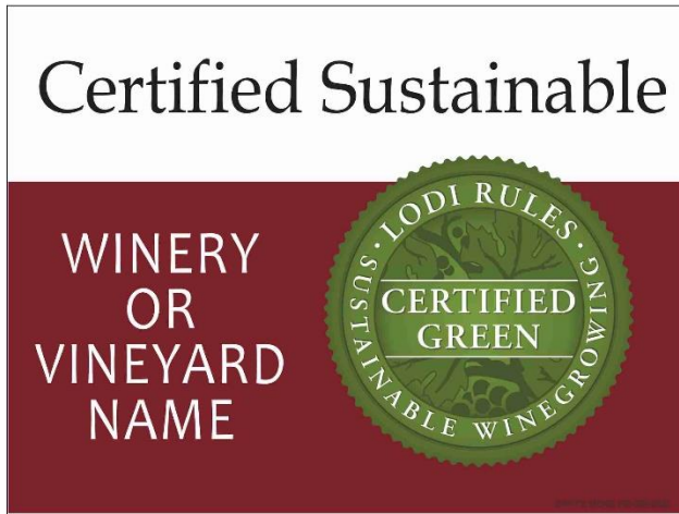
24" x 32" sign templates

LODI RULES Vineyard and Winery Signs are available from Gary's Signs in Lodi. Permanent signs are a wonderful way to communicate your commitment to sustainable agriculture. Signs are available for purchase to all growers participating in the LODI RULES program and all wineries using the LODI RULES or CALIFORNIA RULES seal on wine labels (certification status is confirmed before purchase may be completed). The signs can be installed in any high-visibility location. Two sign options are available: a horizontal orientation and a vertical orientation. The horizontal option (24" x 32") is designed to be read from a passing car, so it is well-suited for road-side vineyards. The vertical option (32" x 24") is designed for easy installation and its geometry is appropriate for tight spaces such as winery parking lots or seating areas. However, feel free to choose either sign for any application.