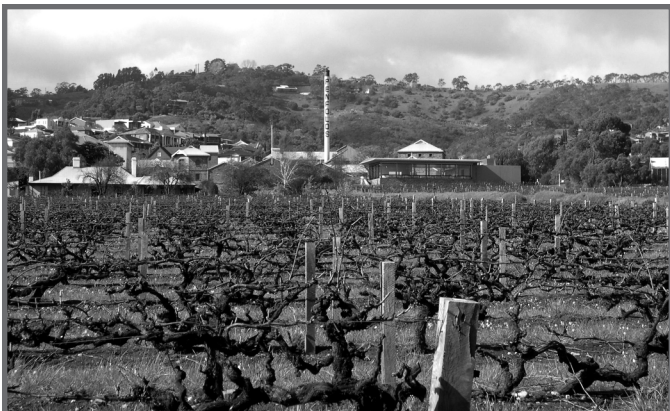
100 PLUS YEAR-OLD SHIRAZ (SYRAH) VINES IN THE FAMOUS PENFOLD'S GRANGE VINEYARD IN ADELAIDE