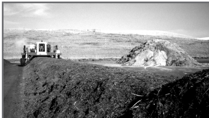
TURNING A COMPOST WINDROW AT A COMPOSTING OPERATION

In vineyards, compost additions are done mainly to enhance existing soil properties. In soils with high clay contents, compost additions can avoid soil crust formation and thus enhance the efficiency of drip emitters. In sandy soils, compost adds structure and water holding capacity. There have also been claims of disease suppression in vines, however substantiated reports on disease suppression are few and often conflicting. Typical compost application rates range from 10 to 20 tons/acre when establishing vineyard. When determining an application rate, growers should consider soil