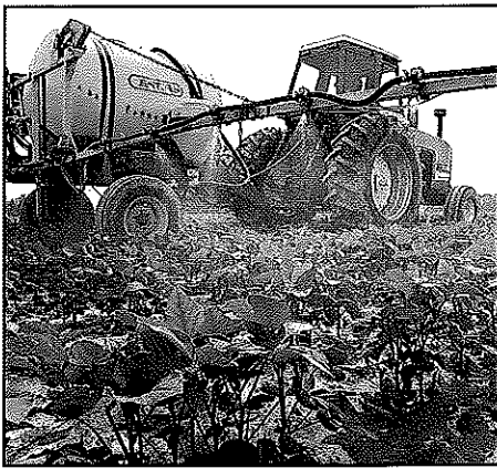
An integrated approach to weed control, which calls for crop and herbicide rotation, tillage or cultivation and field scouting, is the key to reducing herbicide resistance.

Recognizing the potential for weed resistance, herbicide experts have recommended rotating chemical families to prevent build-up of resistant weeds. But, McGlamery says, it's not just widespread use of a specific herbicide family that can lead to weed resistance. "We know that if a plant is resistant to one family of chemicals that affects a specif-