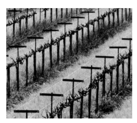
Expect some uneven bud break and some abnormal vine responses this spring

As the pruning in the district passes the halfway point, there is lots of uncertainty about everything, except quality will be the focus of growers and wineries. If you are still able to determine some dormant pruning weights for individual vines at this time, you can use those and compare them to the average crop yield per vine, calculated from the field